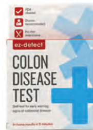
EZ Detect™ Colon Cancer Test Kit† Count: 1