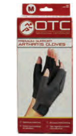
Arthritis Gloves, Medium Count: 1 pair