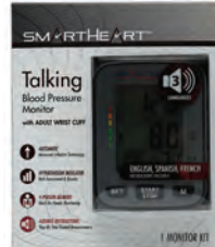
Blood Pressure Monitor, Wrist Talking† Count: 1