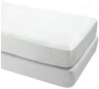
Elastic Mattress Cover, 80" x 36" x 6" Count: 1