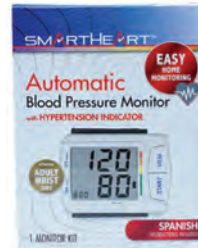
Blood Pressure Monitor, Wrist† Count: 1