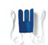
Sock Aid Count: 1