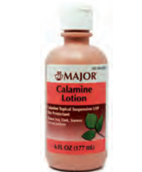
Calamine Lotion, 6 oz. Count: 1