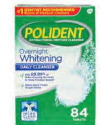
Polident® Overnight Count: 84