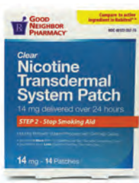
Nicotine Patches, Step 2 † Strength: 14 mg. / 24 hr. Count: 14