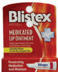
Blistex® Ointment, 0.15 oz. Count: 1