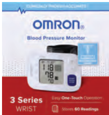
Blood Pressure Monitor, Wrist, Omron®† Count: 1