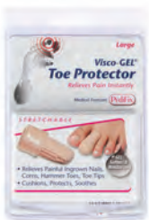
Toe Protector, Large Count: 1