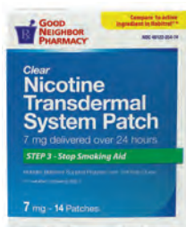
Nicotine Patches, Step 3 † Strength: 7 mg. / 24 hr. Count: 14