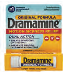
Dramamine® Tablets Strength: 50 mg. Count: 12