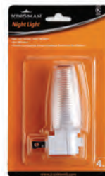
Night Light Count: 1