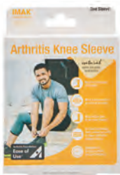
Arthritis Knee Sleeve, Small Count: 1