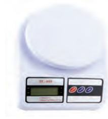
Kitchen Scale, Digital† Count: 1