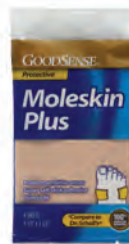
Moleskin Sheets Count: 4