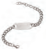
Medical ID Bracelet, Heart Count: 1