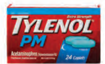
Tylenol® PM Extra Strength Tablets Strength: 500 mg. Count: 24