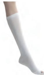
Anti-Embolism Stockings, Large Count: 1 pair