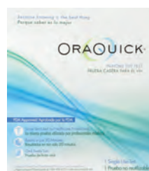
HIV Test† Count: 1