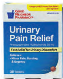
Urinary Pain Relief Strength: 95 mg. Count: 30