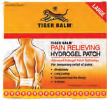
Tiger Balm® Patch, Large Count: 4