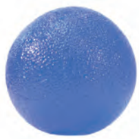
Gel Hand Exerciser Ball, Medium Count: 1