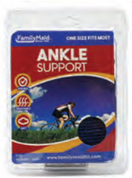
Ankle Support Count: 1