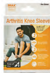
Arthritis Knee Sleeve, Medium Count: 1