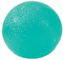
Gel Hand Exerciser Ball, Extra Firm Count: 1