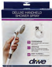
Handheld Shower Head Count: 1