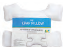
CPAP Pillow Fiber Filled Count: 1