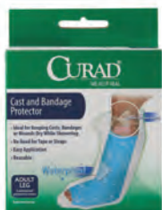
Cast, Bandage & Wound Protector, Leg Count: 2