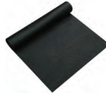
Yoga Mat Count: 1