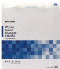
Gauze Sponges, 4" x 4"* Count: 25