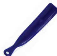
Shoe Horn Count: 1