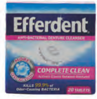
Efferdent® Tablets Count: 20