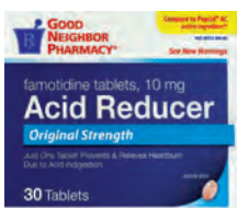
Famotidine Acid Reducer* Strength: 10 mg. Count: 30