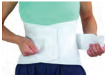
Back Support Elastic, 24" to 46" Count: 1