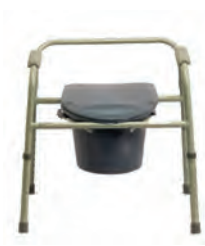
Bedside Commode* Count: 1