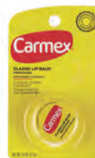
Carmex® Count: 1