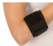
Tennis Elbow Support Count: 1