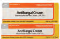
Miconazole Nitrate, 1 oz. Strength: 2% Count: 1