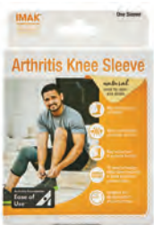
Arthritis Knee Sleeve, Large Count: 1