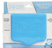
CPAP Mask Wipes Count: 72