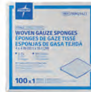
Gauze Pad, Sterile* Count: 100