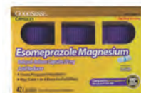
Esomeprazole Magnesium Acid Reducer, Delayed Release Tablets* Strength: 20 mg. Count: 42