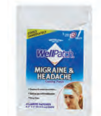
Wellpatch® Migraine Count: 4