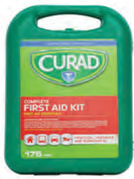
First Aid Kit, 175 Pieces Count: 1