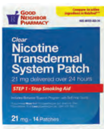
Nicotine Patches, Step 1 † Strength: 21 mg. / 24 hr. Count: 14