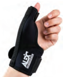
Thumb Brace Count: 1