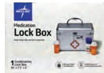
Medication Lock Box Count: 1