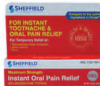
Oral Pain Relief Gel, 0.33 oz. Strength: 20% Count: 1