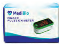
Pulse Oximeter† Count: 1