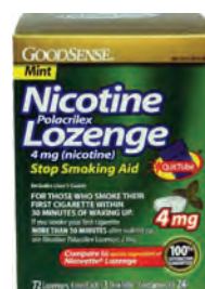
Nicotine Lozenge † Strength: 4 mg. Count: 72