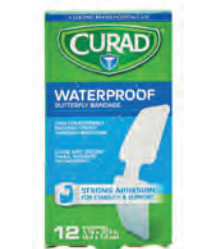
Butterfly Closures Count: 12