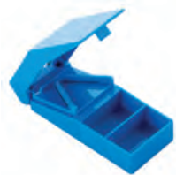
Pill Cutter with Safety Shield Count: 1