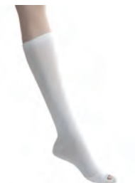
Anti-Embolism Stockings, X-Large Count: 1 pair