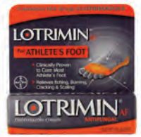
Lotrimin® AF Cream, 0.42 oz. Strength: 1% Count: 1