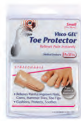
Toe Protector, Small Count: 1