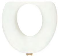
Raised Toilet Seat Count: 1