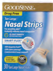
Nasal Strips, Large Count: 30