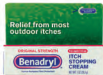
Benadryl® Cream, 1 oz. Count: 1