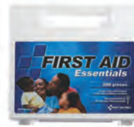
First Aid Kit, 200 Pieces Count: 1