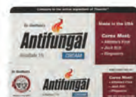
Tolnaftate Antifungal Cream, 1.25 oz. Strength: 1% Count: 1