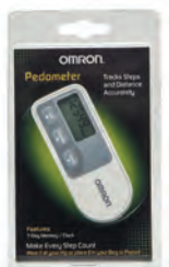
Omron® Pedometer Count: 1