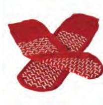
Slipper Socks, One Size Fits Most Count: 1