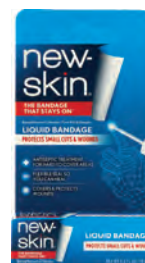
Liquid Bandage, 0.3 oz. Count: 1