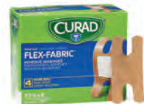
Bandages, Knuckle* Count: 100