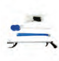
Rehab & Hip Kit (Reacher, Shoehorn, Sock Aid, Bath Sponge) Count: 1