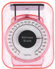
Kitchen Scale, Dial† Count: 1