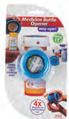
Medicine Bottle Opener with Magnifier Count: 1