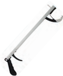
Reaching Aid Device Count: 1