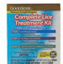
Lice Elimination Kit Count: 1 kit