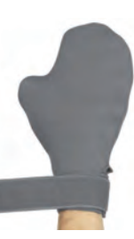
Arthritis Hand Warmer, Reusable Count: 1