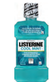
Mouthwash, Listerine® Mint, 8.5 oz. Count: 1