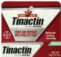
Tinactin® Cream, 0.5 oz. Strength: 1% Count: 1