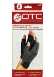
Arthritis Gloves, Large Count: 1 pair