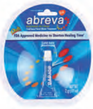
Abreva® Cream, 2 gm. Strength: 10% Count: 1