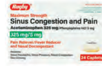
Acetaminophen Sinus Congestion Caplets Strength: 325 mg., 5 mg. Count: 24