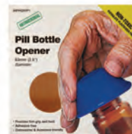
Pill Bottle Opener Aid Count: 1