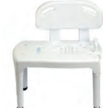
Transfer Bench, Adjustable Count: 1