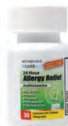
Cetirizine Allergy Tablets Strength: 10 mg. Count: 30