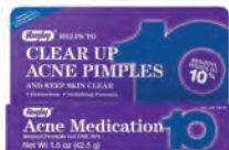
Acne Gel Benzoyl Peroxide, 1.5 oz. Strength: 10% Count: 1