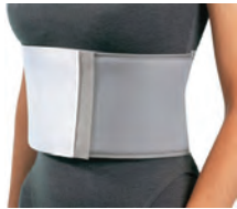
Rib Belt, Female, One Size Fits Most Count: 1