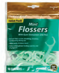
Interdental Flossers Count: 90