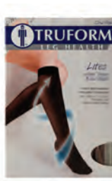
Compression Knee-High Socks, 8-15 mmHg, Women's Beige, Small (Shoe Size 4-5) † Count: 1 pair