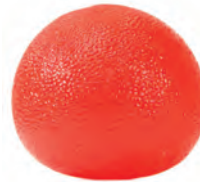
Gel Hand Exerciser Ball, Firm Count: 1