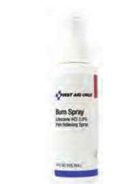
Burn Relief Spray, 4 oz. Count: 1