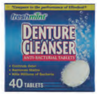
Denture Cleaning Tablets Count: 40