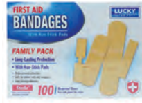
Bandages, Assorted* Count: 100