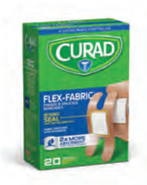
Bandages, Finger and Knuckle* Count: 20