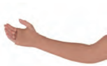
Protective Arm Sleeve, Large Count: 1 pair