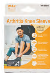
Arthritis Knee Sleeve, X-Large Count: 1