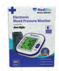
Blood Pressure Monitor, Upper Arm Talking† Count: 1