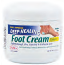
Diabetic Skin Relief Foot Cream, 4 oz. Count: 1