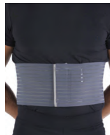
Rib Belt, Male, One Size Fits Most Count: 1