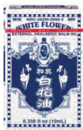
White Flower® Analgesic Balm Oil, 10 ml. Count: 1