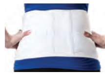
Back Support Elastic with Lumbar Count: 1