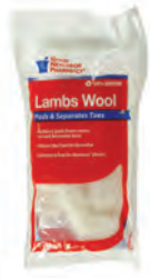
Lamb's Wool Padding Count: 1