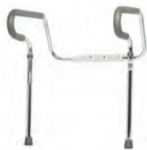
Toilet Safety Rails Count: 1