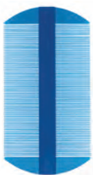
Lice Comb Count: 1