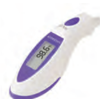
Thermometer, Digital Ear Count: 1