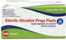
Alcohol Pads* Count: 100