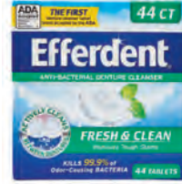
Efferdent® Plus Mint Tablets Count: 44