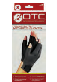
Arthritis Gloves, Small Count: 1 pair