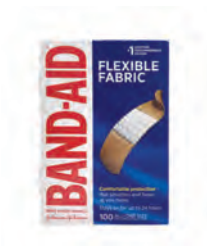
Band-Aids®* Count: 100