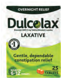
Dulcolax® Tablets Strength: 5 mg. Count: 25