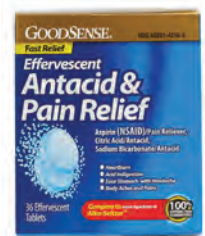
Effervescent Tablets Count: 36