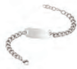
Medical ID Bracelet, Diabetic Count: 1