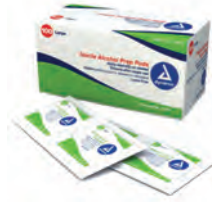
Alcohol Pads, Large* Count: 100