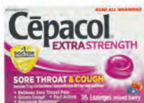
Cepacol® Sore Throat Lozenges Count: 16