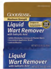
Liquid Wart Remover, 0.31 oz. Count: 1