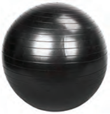
Yoga Stability Ball Count: 1