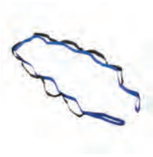
Stretch Strap Count: 1