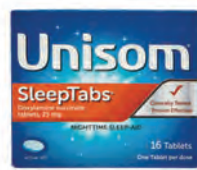
Unisom® Tablets Strength: 25 mg. Count: 16