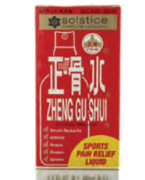
Zheng Gu Shui Analgesic Liquid®, 2 oz. Count: 1