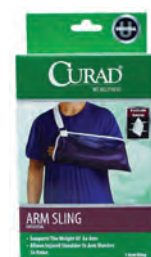
Arm Sling Count: 1