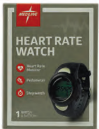
Heart Rate Monitor Watch† Count: 1