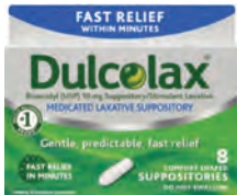
Dulcolax® Suppository Strength: 10 mg. Count: 8