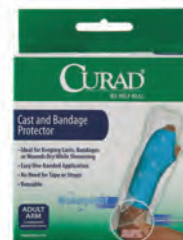
Cast, Bandage & Wound Protector, Arm Count: 2