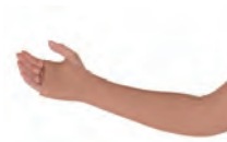
Protective Arm Sleeve, X-Large Count: 1 pair